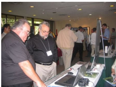
ICETECH 2008 Exhibition Hall