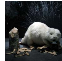
Alaska is beaver (Castor canadensis) territory. This rare white beaver was found near Anchorage. Wildlife can be viewed in the areas surrounding Anchorage.

* Early fee applies to registrations before 20 May 2010.